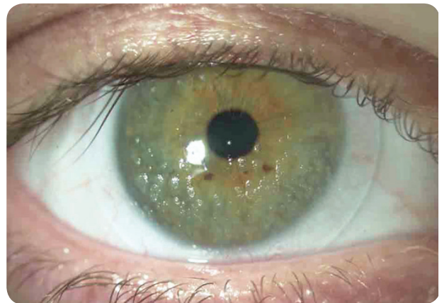
Contact Lens in poor condition with deposits