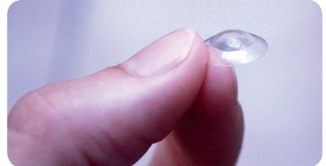
A soft baby contact lens with a bubble like centre